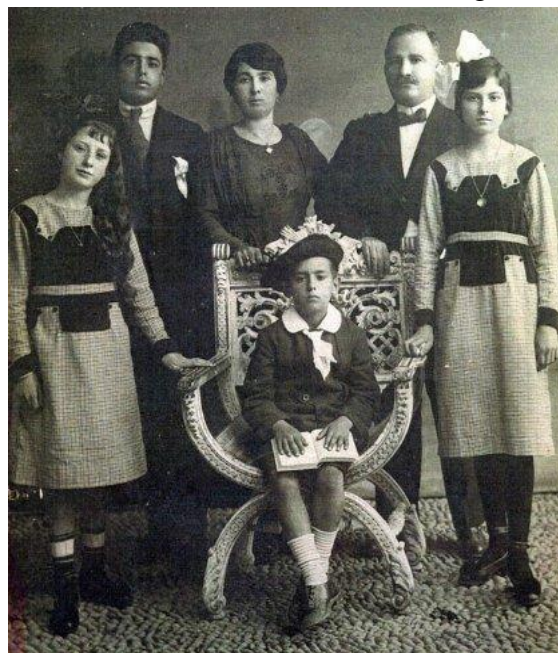
Family Photos – Rhodes Jewish Museum